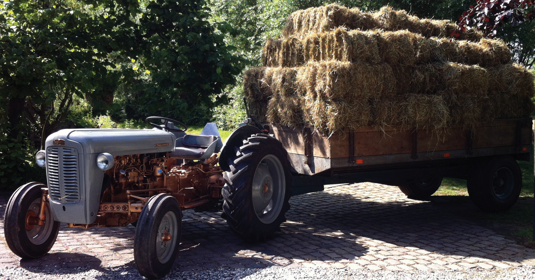
1957 FE 35, Serial Number #53064, belonging to Thomas van der Luit of Epen, Limburg, Netherlands The trailer is Dutch built by Bav, but they built the trailers equal to the Ferguson trailers for the wet Dutch soil conditions.