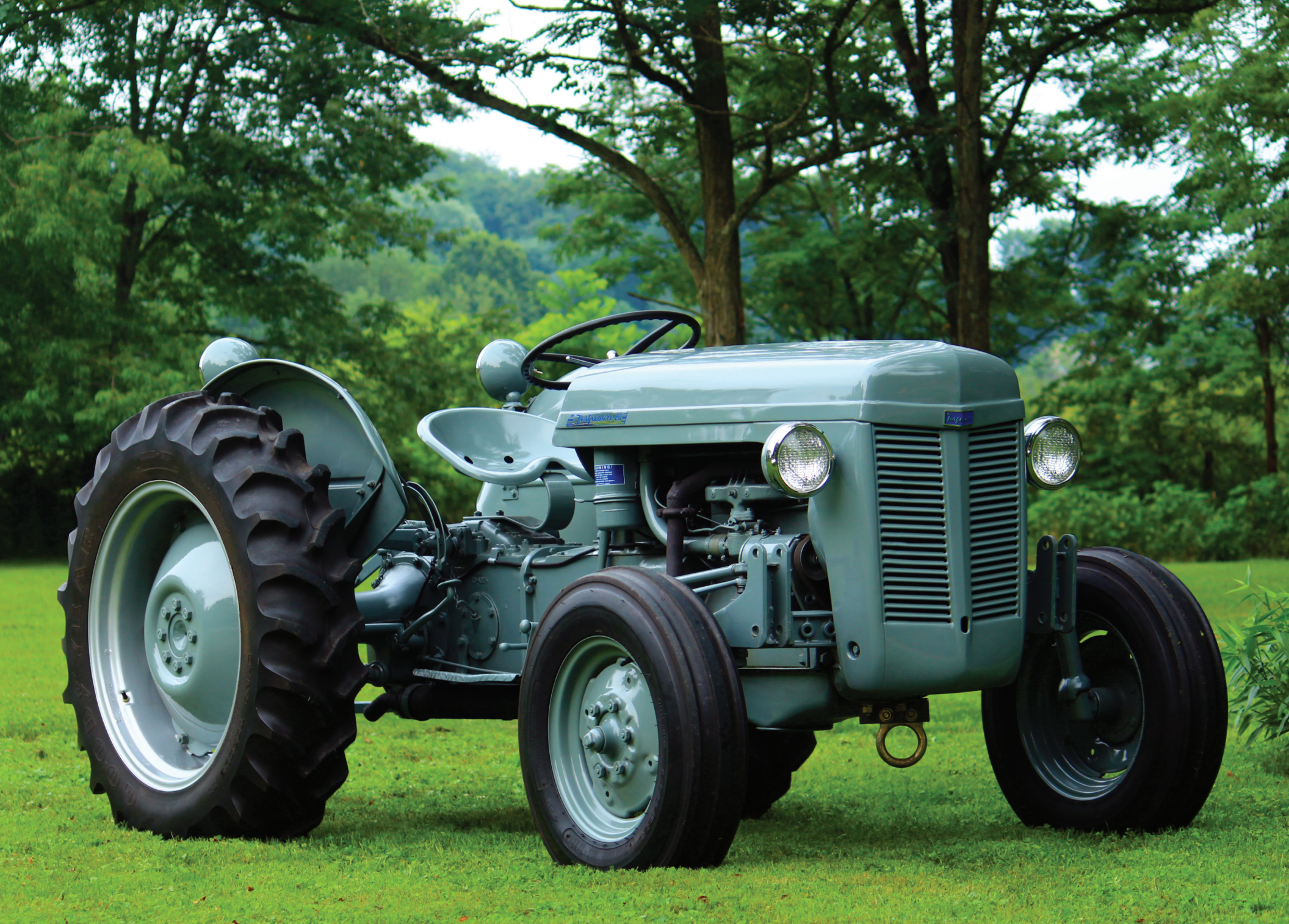
1949 TO-20 belonging to Carl Morrison of Frazeyburg, OH