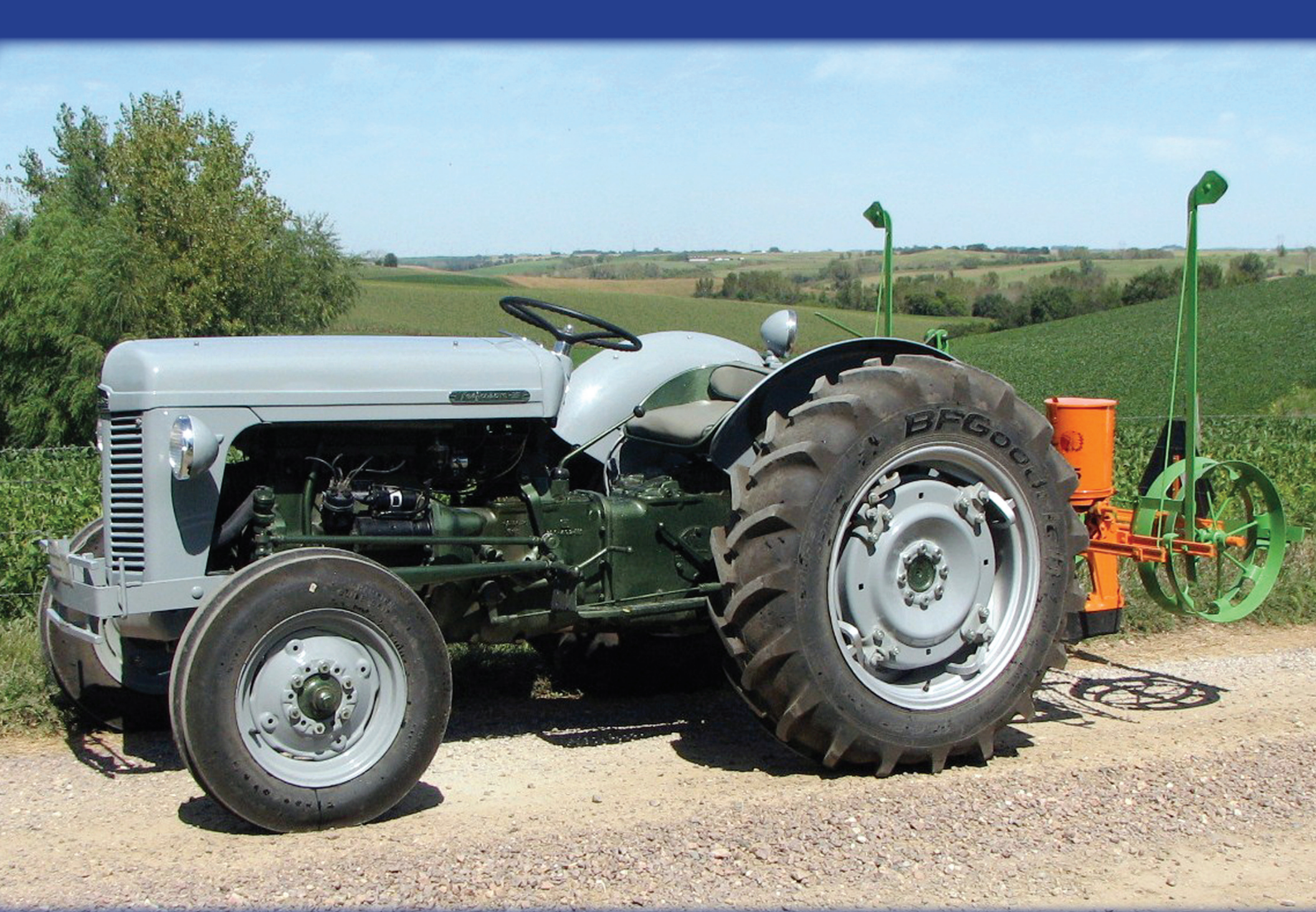
1955 TO-35 belonging to TomWingert of Souix City, IA, with a BlackHawk corn planter made by Cockshut to fit the 3-point hitch